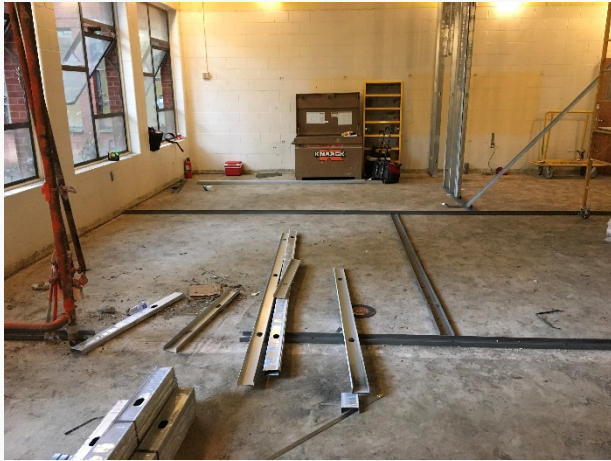
Interior Stud Framing