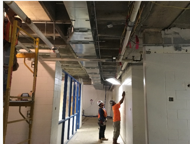
Overhead Mechanical Rough In