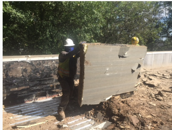
Building pad and site New ductwork and re-roof